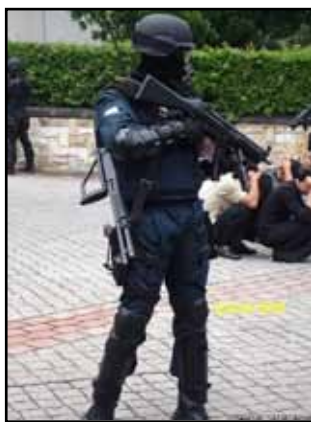
Special Forces Unit, Kopassus

Human rights groups estimate that at least 100,000 have died in the ensuing conflict. A guerrilla resistance has largely given way to peaceful resistance and a call for dialogue with the Jakarta Government.